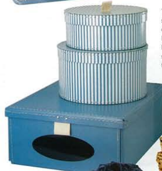
Lyckeby striped storage box set $19, from IKEA.