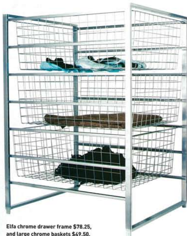
Elfa chrome drawer frame $78.25, and large chrome baskets $49.50, from The Storage Shop.

There's a place — and a space — for everything if you know where to look