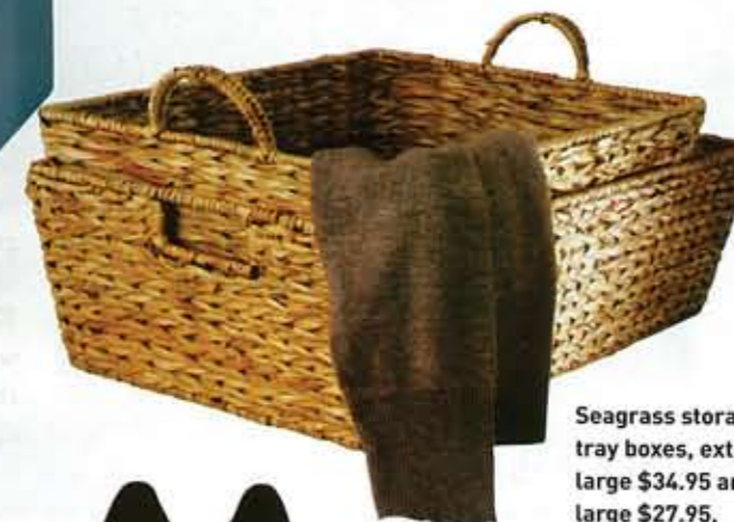
Seagrass storage tray boxes, extra large $34.95 and large $27.95, from Bayswiss.