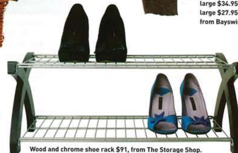
Wood and chrome shoe rack $91, from The Storage Shop.