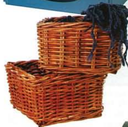
Bastant rattan baskets, $12 each, from IKEA.